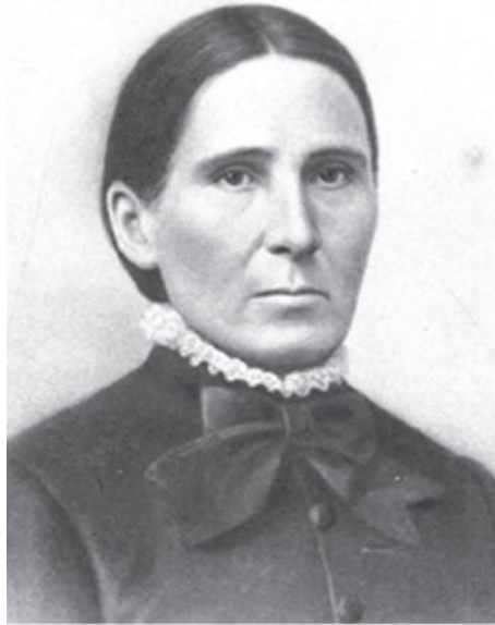
Figure 2. Martha Jane Knowlton Coray (June 3, 1821 – December 14, 1881)

the healing of the body must be in the [temple] font, those coming into the Church, and those re-baptized [to renew their baptismal covenants] may be baptized in the river.” 9