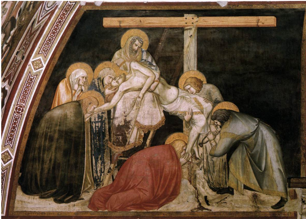
Figure 7. Pietro Lorenzetti, ca. 1280-1348: Deposition of Christ from the Cross , Lower Basilica of San Francesco d’Assisi, ca. 1320. 31

Seeing anticipatory symbolism in this story, the Seder Eliyahu Rabbah specifically adds that the Messiah will be the very “Son of the Widow” whom Elijah raised from the dead. 30