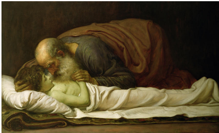
Figure 5. Frederic Leighton, 1830-1896: Elisha Raising the Son of the Shunamite , 1881

Joseph Smith’s words about the gesture of embrace in the resurrection recalls similar symbolism in the stories of Elijah and Elisha, who each employed a similar ritual gesture as they raised a dead child back to life. 20 The more detailed account of Elisha reads as follows (see Figure 5): 21