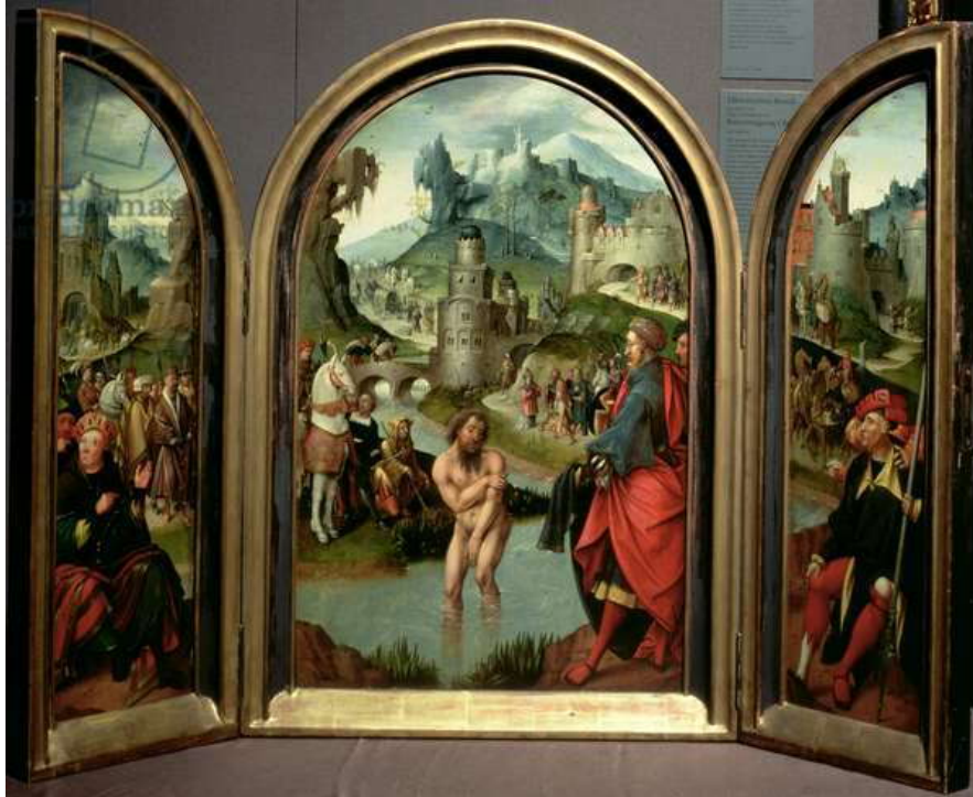
Figure 1. Cornelis Engelbrechtsen (1468-1533): Triptych of the Cleansing of Naaman: the center panel depicts Naaman, commander of the Syrian army, washing in the River Jordan to cure his leprosy at the command of the prophet Elisha, who in the background refuses gifts offered to him, 1520

An Old Testament KnowWhy 1 relating to the reading assignment for Gospel Doctrine Lesson 29: "He Took Up ... the Mantle of Elijah" (2 Kings 2:5-6) (JBOTL29B)