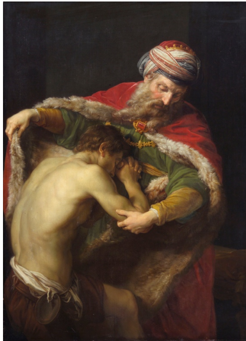
Figure 4. Pompeo Batoni, 1708-1787: The Return of the Prodigal Son, 1773